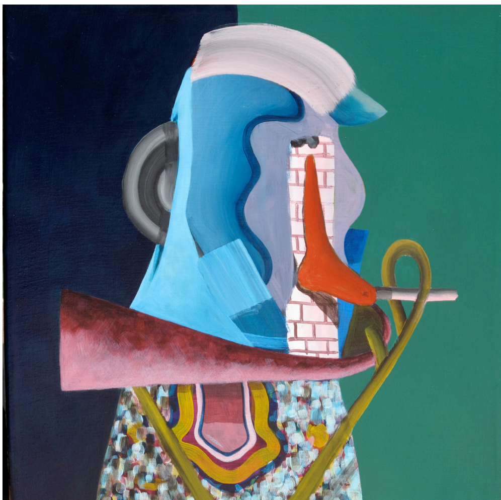
GORKA MOHAMED, DELIBERATING, 2010 ACRYLIC ON CANVAS, 50 X 50 CM