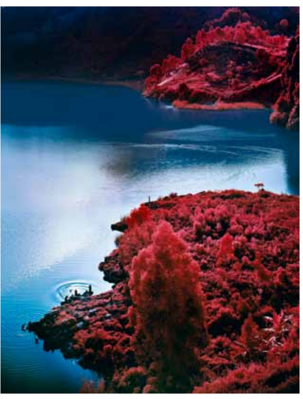
Lac Vert, 2012 C-print 93 x 72 in. (236.2 x 182.9 cm.) Edition of 2 +1AP

The Vinyl Factory is an independent British music and arts enterprise. In existence since 2001, the group encompasses a record label, vinyl pressing plant, gallery spaces, record shop and music magazine. The Vinyl Factory galleries include two spaces in London, The Vinyl Factory Soho and The Vinyl Factory Chelsea - Exhibitions and events in these spaces, include 2012-2013 shows by Dinos Chapman, Kraftwerk, David Bowie and Punk. In May 2009 the London gallery hosted the Island Records 50th anniversary. The Vinyl Factory record label collaborates with musicians and artists to produce and release limited edition vinyl, as well as create accompanying exhibitions, events and audio-visual shows. Our label roster includes releases with Massive Attack, Dinos Chapman, Florence + the Machine. Christian Marclay, Pet Shop Boys, Martin Creed, Bryan Ferry, The xx, Duran Duran and Jeremy Deller.