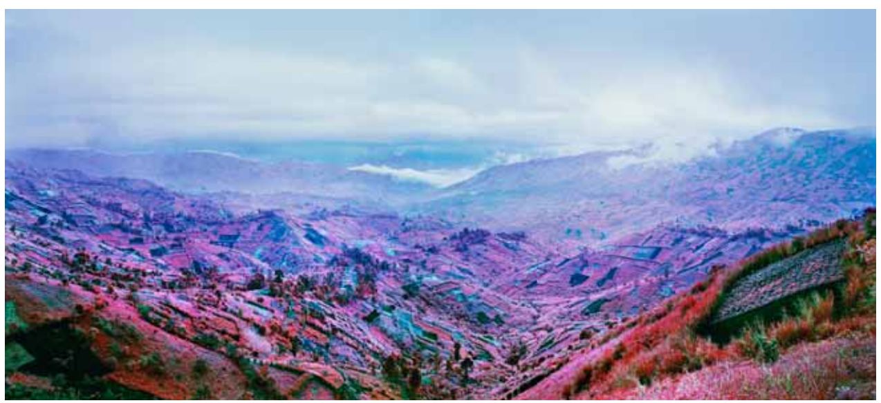
Because the Night, 2012 - C-print -54 x 114 in. (137.2 x 289.6 cm.) / Edition of 5 +1AP

The Vinyl Factory and Edel Assanti are pleased to present The Enclave , Richard Mosse's debut London solo exhibition. The Enclave , a multichannel video installation, was originally commissioned for the Irish Pavilion at the 55th Venice Biennale. The Enclave is the culmination of Mosse's work in eastern Democratic Republic of Congo. The installation will be accompanied by a presentation of large format photographic works.